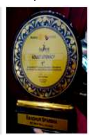
1st prize Adult Literacy RCC Bandhur Sparsha

Our four RCC joined RCC award ceremony. They got Certificate of Appreciation. RCC Bandhur Sparsha got 1st prize on Adult Literacy. Special recognition from RCC District Committee 2023 -24 received by RCC SNDMA Nari Kalyan Samity, RCC Mirpur Rural Centre & RCC Bantra Anathbandhu Samity. District Governor's Special recognition by RCC District Committee 2023 - 24 RID 3291 - Mother & Child was awarded RCC Mirpur Rural Centre.