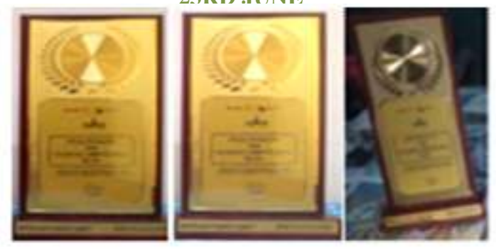
Special recognition from RCC District Committee 2023-24

RCC SNDMA Nari Kalyan Samity, RCC Mirpore Rural Centre & RCC Bantra Anathbandhu Samity