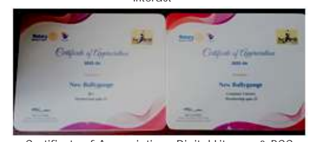
Certificate of Appreciation - Digital Literacy & RCC